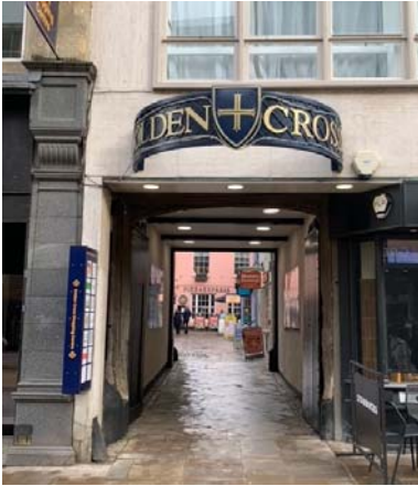
The Golden Cross Inn, Cornmarket