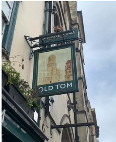
Old Tom, St Aldates