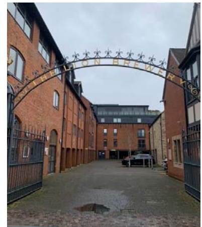
The Lion Brewery, St Thomas Street