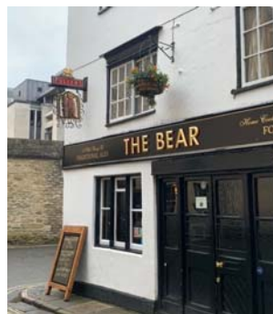
The Bear, Alfred Street