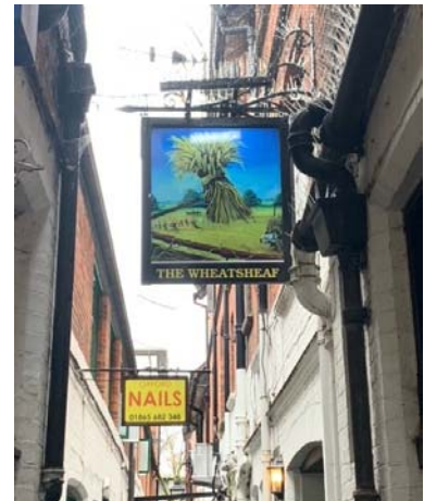
The Wheatsheaf, High Street

At the Northbourne Centre, Church Street Didcot OX11 8DG Thursday 10 th April 2025 at 7.30pm All are welcome. Visitors £4