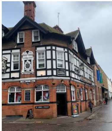
The Royal Blenheim, St Ebbs Street