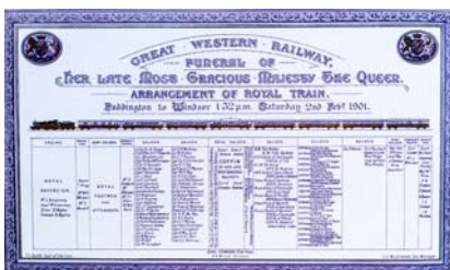
The Royal Train for Queen Victoria's funeral