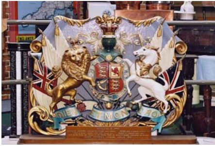
The royal coat of arms