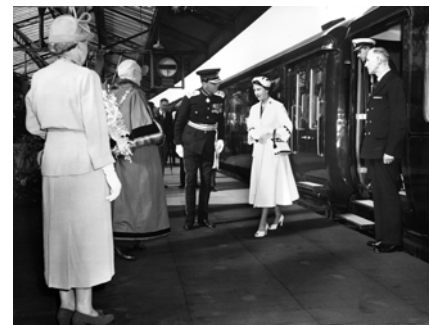
Queen Elizabeth II arriving at Swansea in July 1953