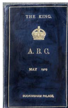
King Edward VII's ABC railway timetable