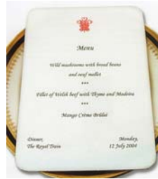
Royal Train menu 2004