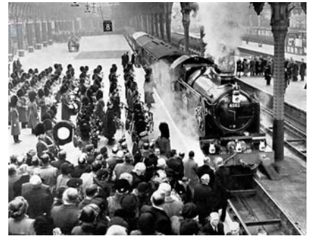
4082 "Windsor Castle" at Paddington