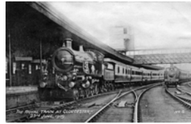
The Royal Train at Gloucester. June 1909