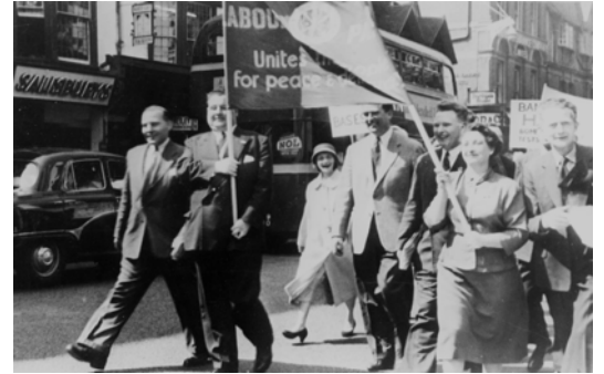
CND march, Cornmarket St, by - Arthur Exell, 1960