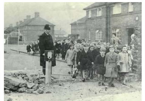
The Cutteslowe Walls

At the Northbourne Centre, Church Street Didcot OX11 8DG Thursday 10 th February 2022 at 7.30pm All are welcome. Visitors £4