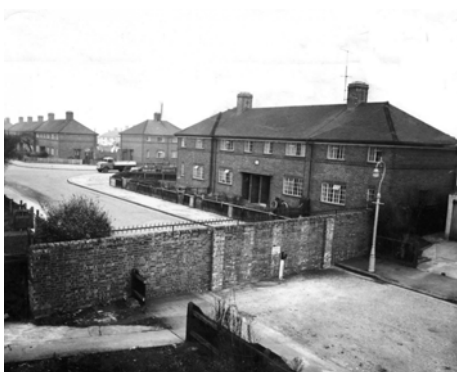
The Cutteslowe Walls